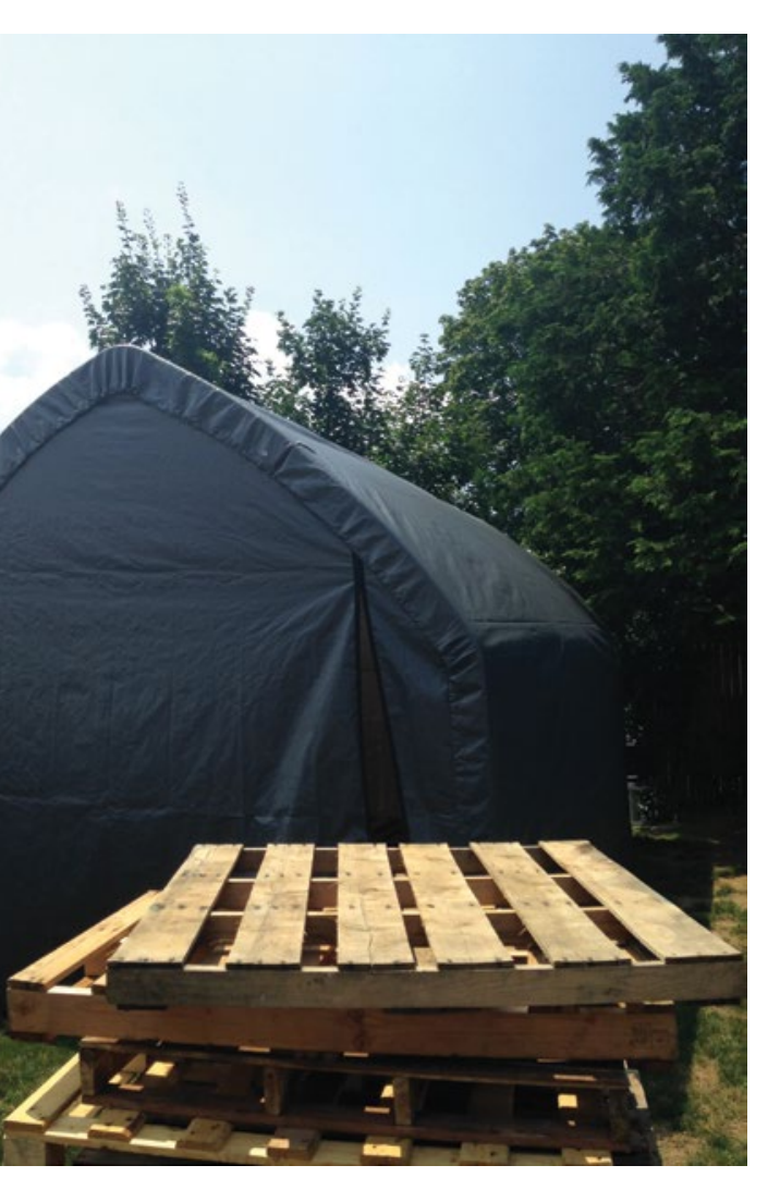
"Amazon started in a garage; we started in a tent."